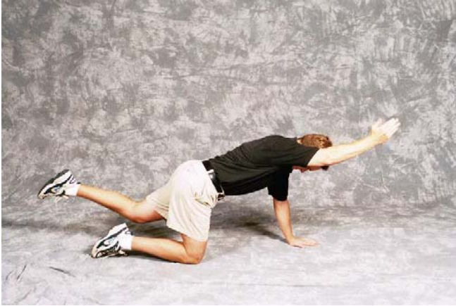
66 A: On Floor