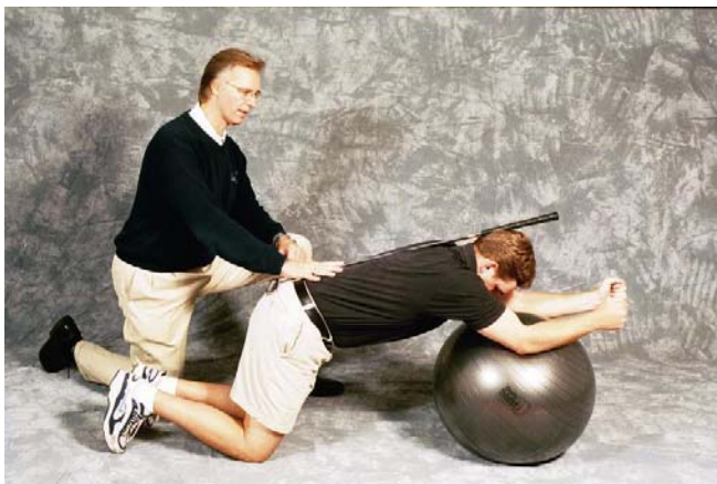
123 B: Finish

Purpose: Improves abdominal strength and increases back strength.